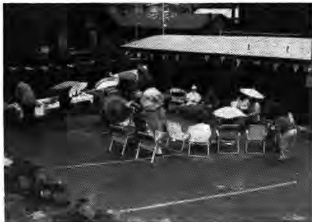
"2129-2235 Fairview's Annual Mt. St. Helen's Memorial Dock Party was rained on but not out."